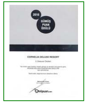
OTEL PUAN – SILVER AWARD