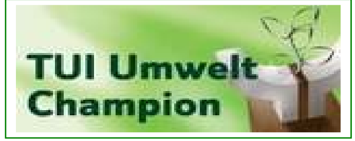
TUI – Environmentally Friendly TOP 100 Hotels Worldwide