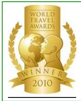
WTA – Europe’s Leading Golf Resort