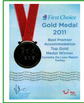
FIRST CHOICE – TOP GOLD MEDAL