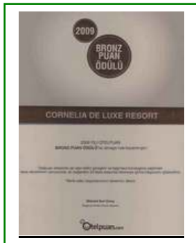
OTEL PUAN - BRONZE AWARD