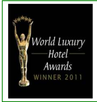
BEST LUXURY COASTAL RESORT