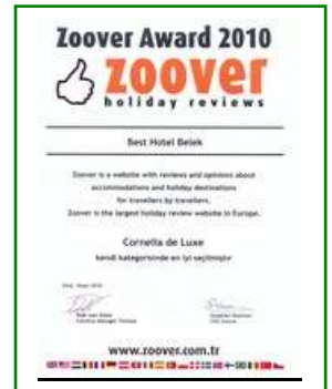
ZOOVER - BEST HOTEL BELEK