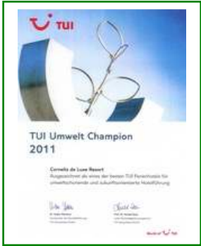
TUI – UMWELT CHAMPION