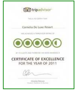
TRIPADVISOR – CERTIFICATE of EXCELLENCE