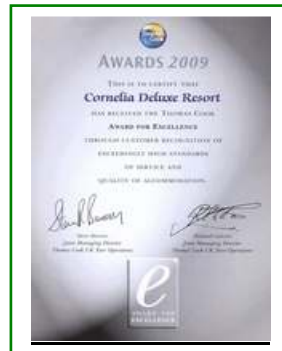
THOMAS COOK - AWARDS for EXCELLENCE