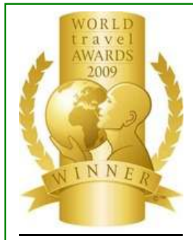
WTA - Turkey's Leading Golf Resort