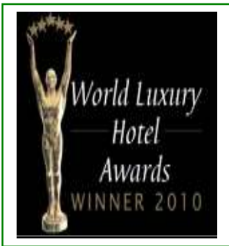
BEST LUXURY COASTAL HOTEL