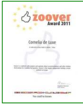
ZOOVER – BEST HOTEL BELEK