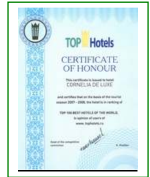
TOP 100 BEST HOTELS - CERT. OF HONOUR