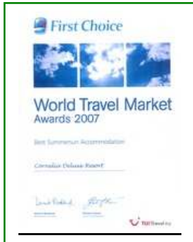
FIRST CHOICE - WORLD TRAVEL MARKET AWARDS