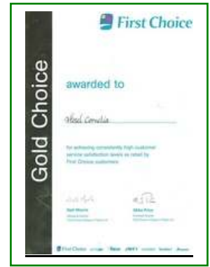
FIRST CHOICE - GOLD CHOICE